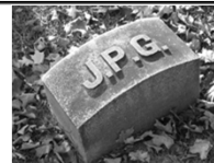
Full quality – 83,261 bytes (2.6:1)