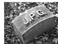
Low quality – 4,787 bytes (46:1)