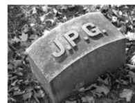
Medium quality – 9,553 bytes (23:1)