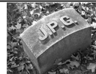
Average quality – 15,138 bytes (15:1)