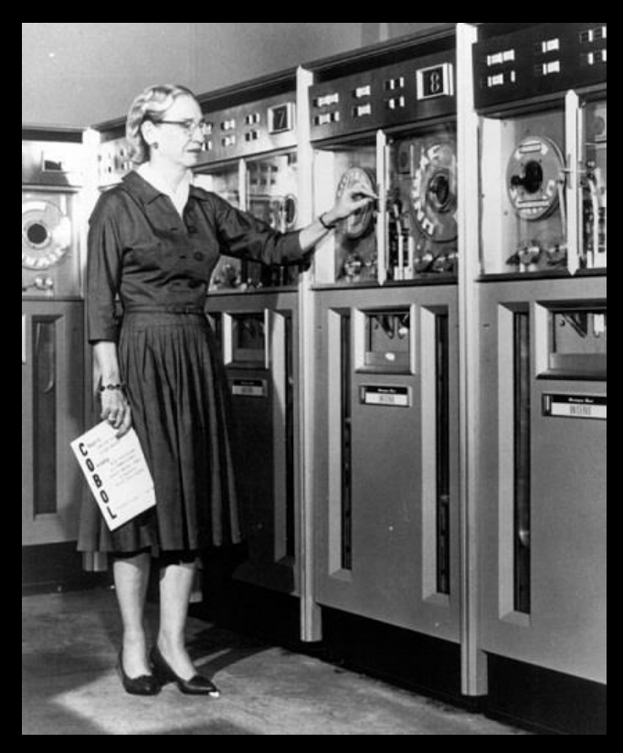
COSC 122 - Page 12